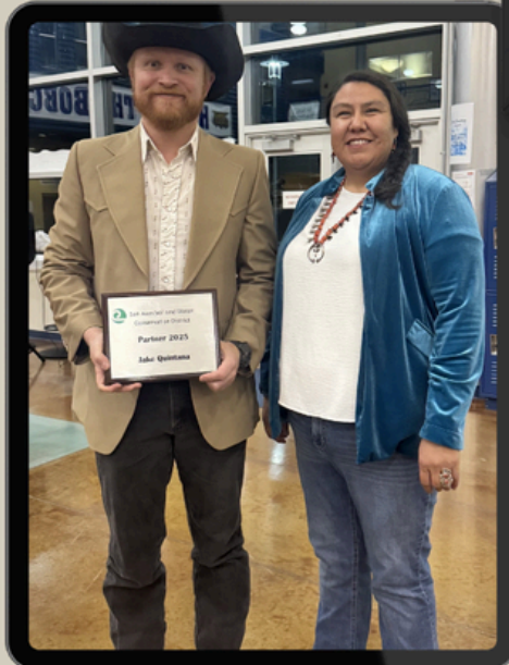
Partners of the Year: